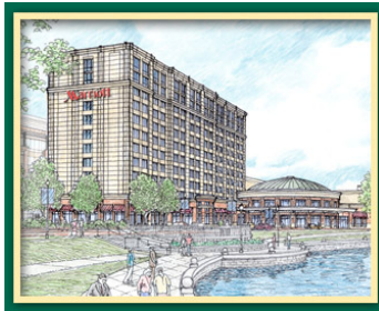
Oyster Point Marriott and Conference Center, 256 guestroom hotel and 40,000 square foot conference center

From concept to construction completion, Warwick Plumbing and Heating is regularly aligned to be completely responsible for these design-build fast track projects, which regularly include the design of HVAC systems, storm drainage systems, sanitary sewers, and potable water systems for the intended facility.