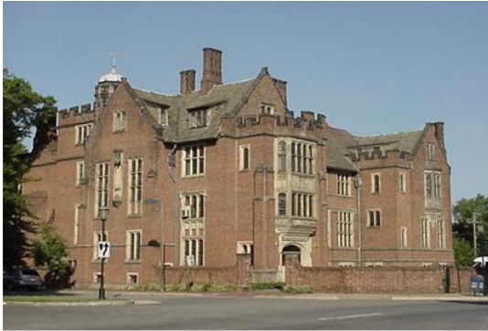
Branch House, Richmond VA