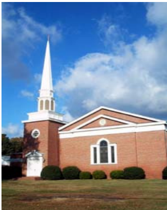
Yorkminster Presbyterian, York County VA

We are the preferred plumbing contractor for several large general contractors in the Virginia and North Carolina area, with projects ranging from commercial remodels to large multi-story buildings, museums, distribution centers and hospitals. We have been completing a wide range of commercial projects for over 50 years. Warwick Plumbing and Heating is multi-faceted, having the experience to install volume quantities of drains, sinks, pumps, tanks, valves, and toilets.