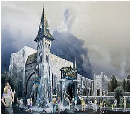
DarKastle at Busch Gardens, Williamsburg VA