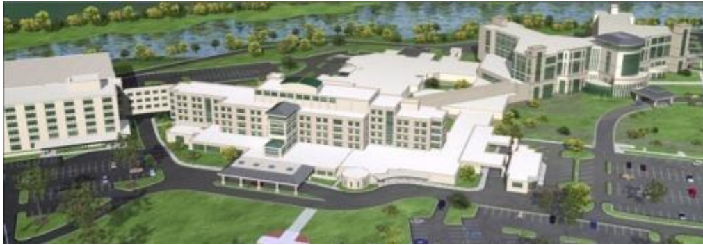
Riverside Regional Medical Center

Warwick Plumbing and Heating professionals understand current industry trends toward more stringent certification and testing requirements as well as the fundamentals of medical gas distribution. Medical gas installations have effectively placed hospital plumbing professionals directly into the loop of patient care.